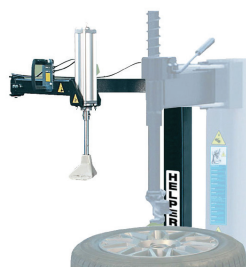
SX1 / Helper Arm