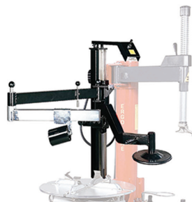
RPX / Helper Arm